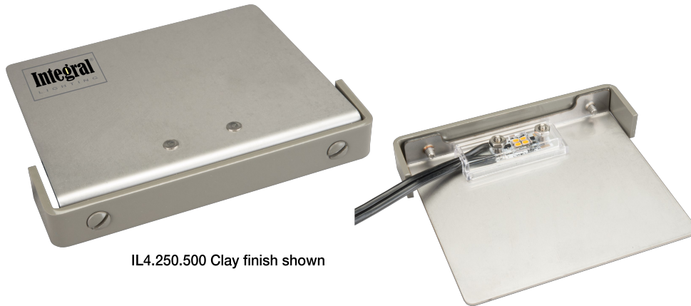
IL4.250.500 Clay finish shown