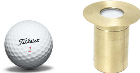
Golf Ball Shown for Scale