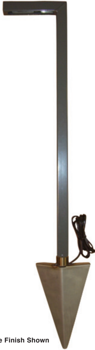
PL24.225 Bronze Finish Shown