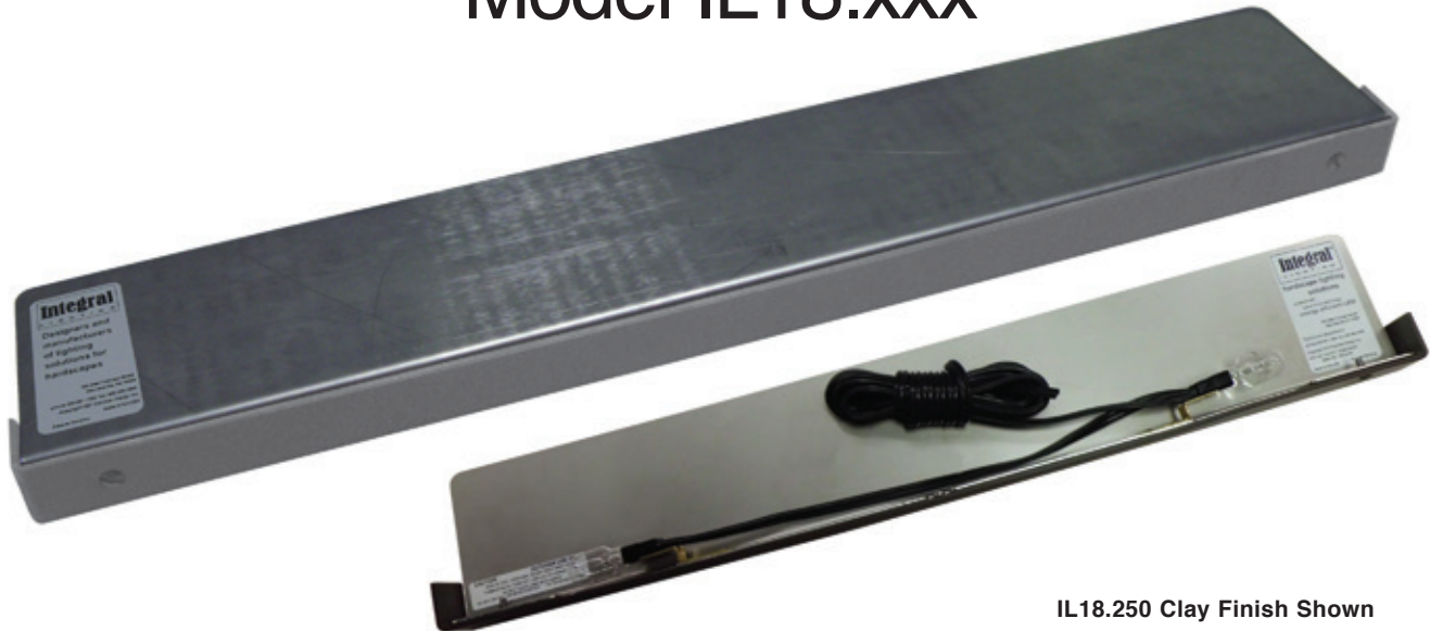
IL18.250 Clay Finish Shown