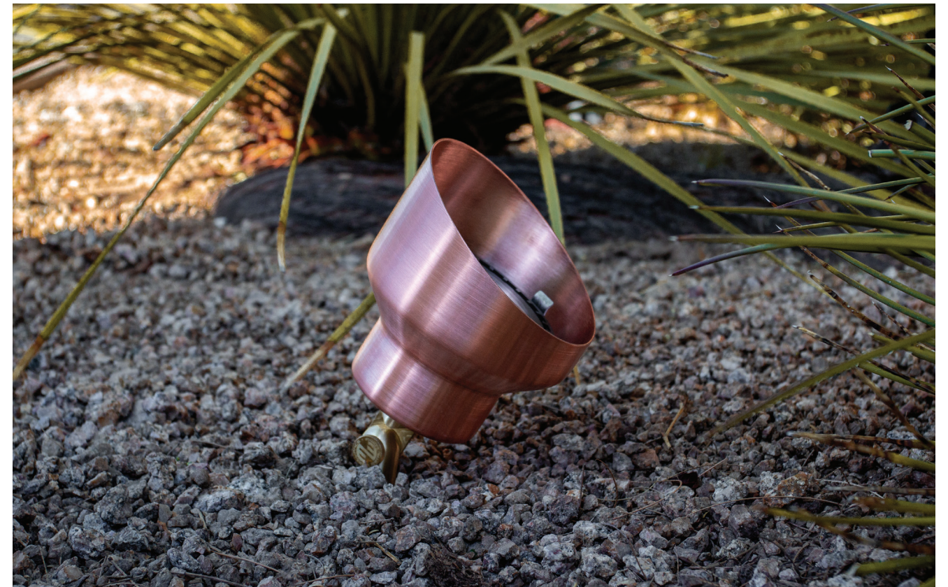
GRAND CANYON DL-PAR36-CU