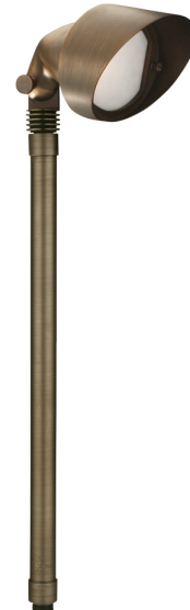
CL-734B-AB-18 18" Stem shown