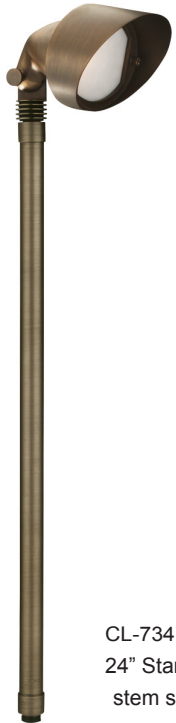
CL-734B-AB 24" Standard stem shown