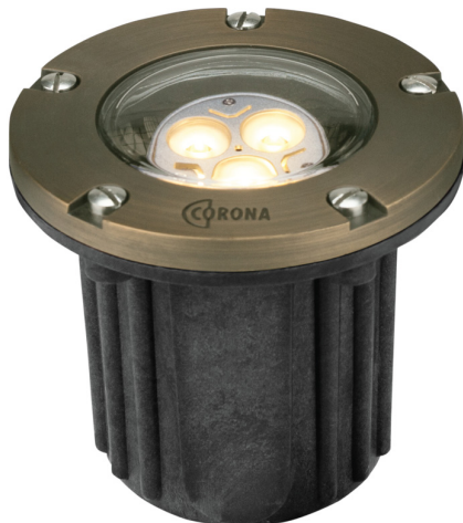
SHOWN WITH LED LAMP

Limited lifetime warranty on fixture Brass face plate and ten (10) years on housing against manufacturer's defects.