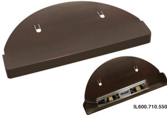
IL600.710.550 Textured Bronze Finish Shown