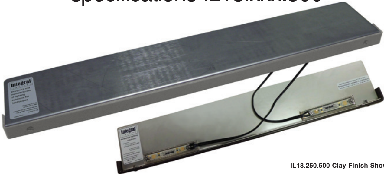
IL18.250.500 Clay Finish Shown