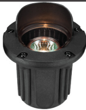
CL-338-BK (Available in AB & GM)