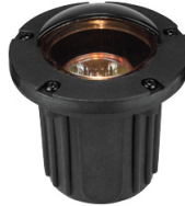
CL-340-BK (Available in AB & GM)