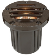
CL-339-BZ (Available in AB & GM)