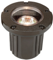
CL-337-BZ (Available in AB & GM)

Please read carefully before installation SAVE THESE INSTRUCTIONS