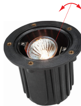
Fixture socket tilts for \pm 25^\circ